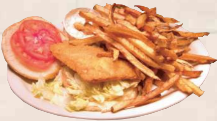
FISH SANDWICH & FRIES

Your Choice 5.95 HOT DOG & FRIES (2) CHICKEN STRIPS & FRIES GRILLED CHEESE & FRIES SHRIMP BASKET & FRIES SPAGHETTI WITH PLAIN SAUCE