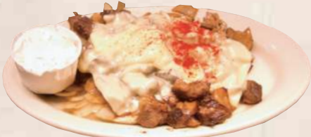
PHILLY STEAK SANDWICH

HOMEMADE CHEESECAKE 4.95 WITH TOPPING 5.95