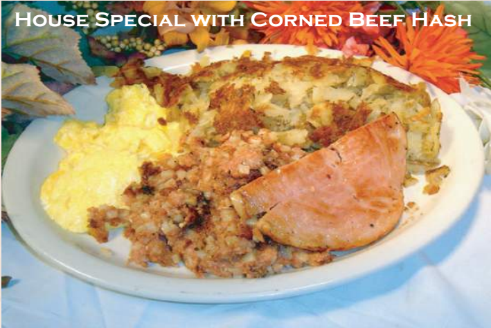
HOUSE SPECIAL WITH CORNERD BEEF HASH

SAMPLER BREAKFAST 26.95 (3) eggs, with bacon, ham, corned beef hash, gyro, sausage, home fries & toast.