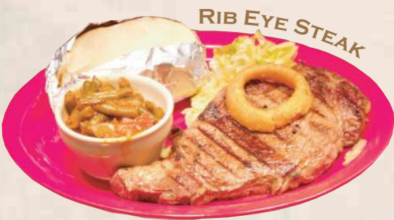
RIB EYE STEAK