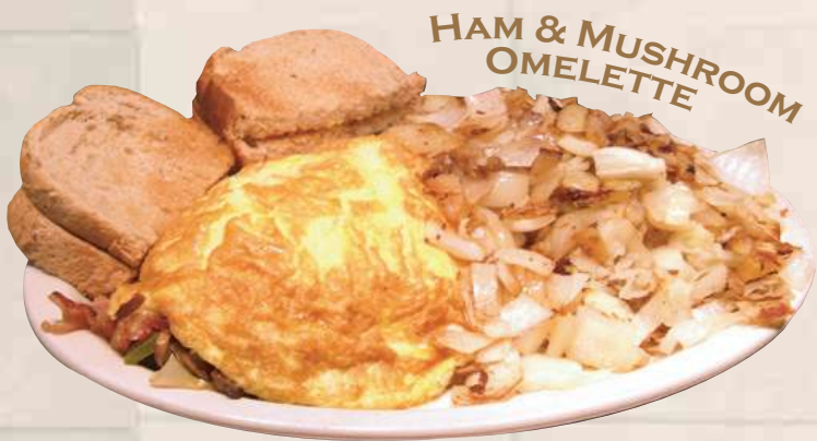
HAM & MUSHROOM OMELETTE