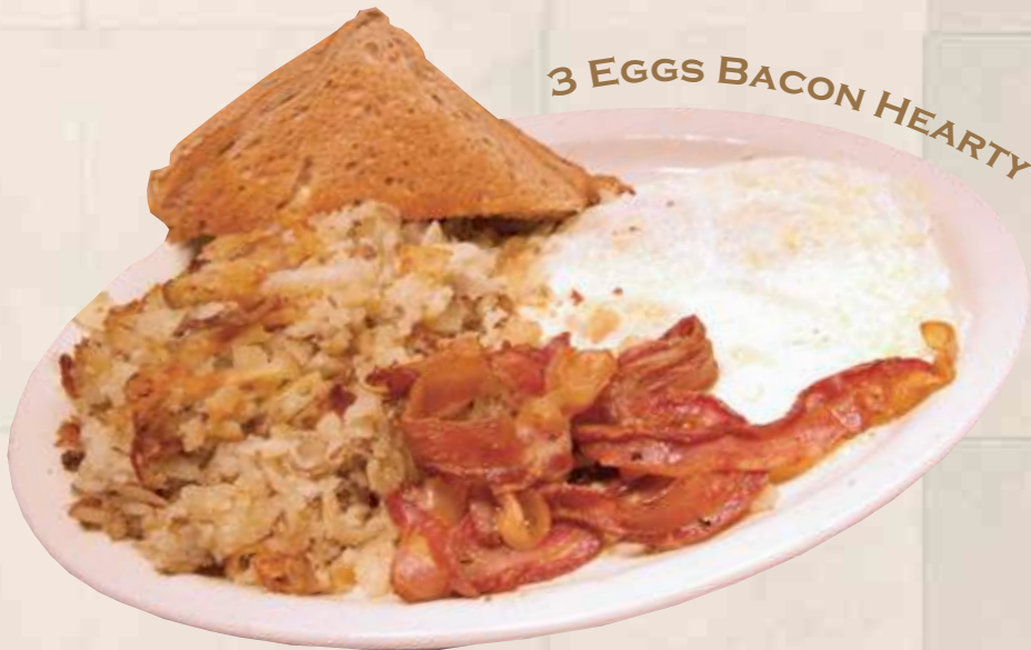
3 EGGS BACON HEARTY

Served with Toast & Jelly. Substitute toast with one pancake Add 3.00 or extra cheese Add 2.00 Topped with Chili Add 3.75