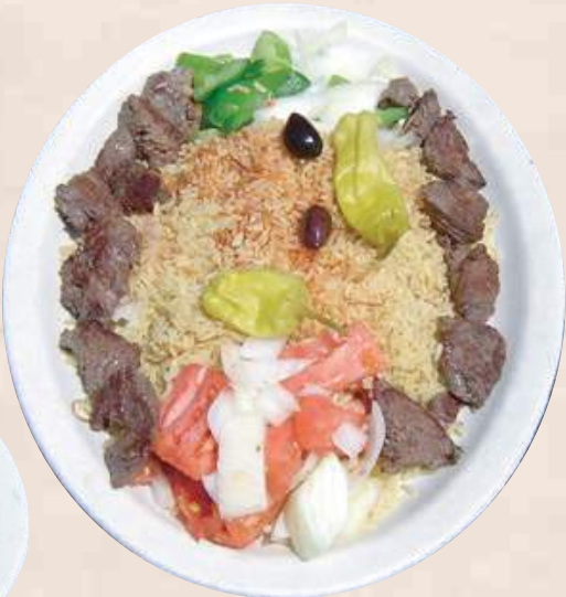
BEEF SHISH KABOB

Start your morning off right with a glass of chilled fresh juice! Orange, Tomato Juice, Apple or V8 Juice and Cranberry Juice