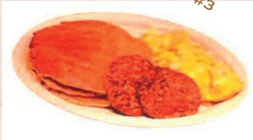
HEARTY BREAKFAST #3

HEARTY BREAKFAST #1 13.95 (3) eggs, (2) fluffy pancake, with your choice of bacon, or sausage, or ham.