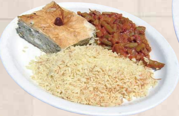
SPINACH PIE WITH VEGGIE & RICE