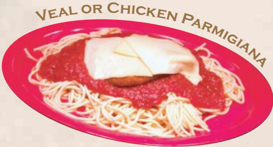
VEAL OR CHICKEN PARMIGIANA