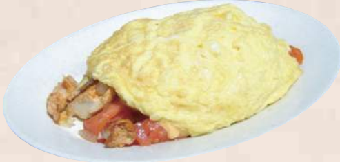
GRILLED CHICKEN BREAST OMELETTE

L-C Two 13.95 Three eggs any style, topped with melted cheese and your choice of sausage, or bacon, or ham, or turkey, or hamburger patty.