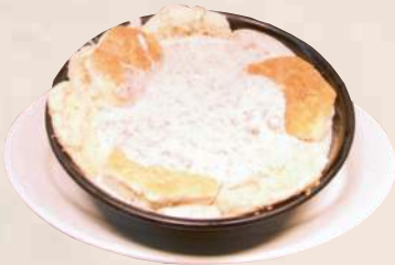
LARGE BISCUIT & GRAVY