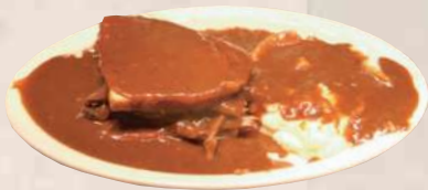
HOT ROAST BEEF

Your Choice 11.95 SPAGHETTI Served with plain sauce or add a meatball,. Add garlic bread 1.00. GRILLED CHICKEN BREAST With mashed potatoes. LIVER & ONIONS With mashed potatoes & gravy, & vegetable. FISH FILLET With choice of potato. HAMBURGER PATTY With choice of potato. Greek Salad 4.50 Extra